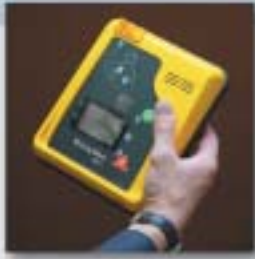
Compact, lightweight design.