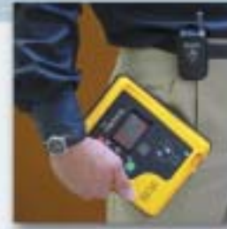
Ready for rescue.