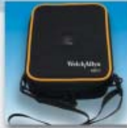
Rugged carrying case.